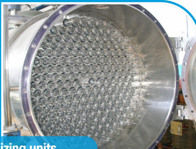
Turnkey ozonizing units